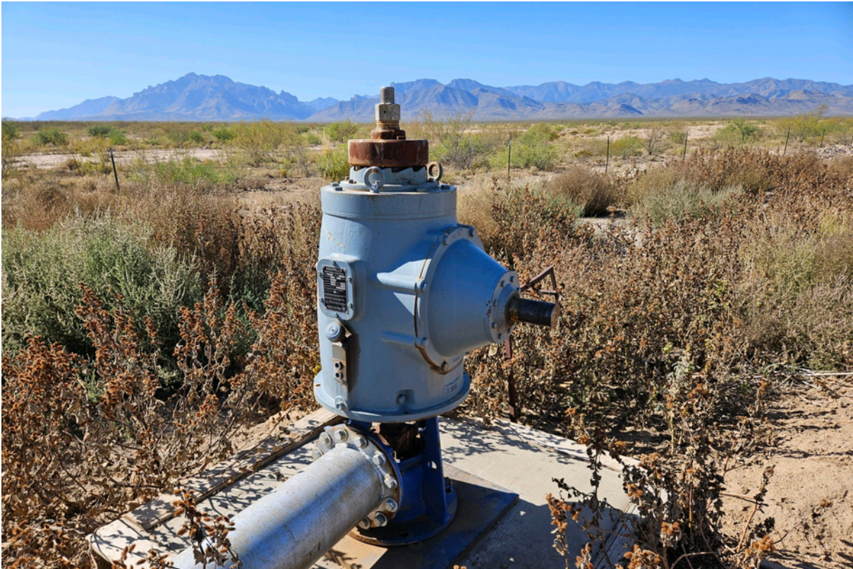
Well #1 - 3400+gpm estimated to 6,000 gpm