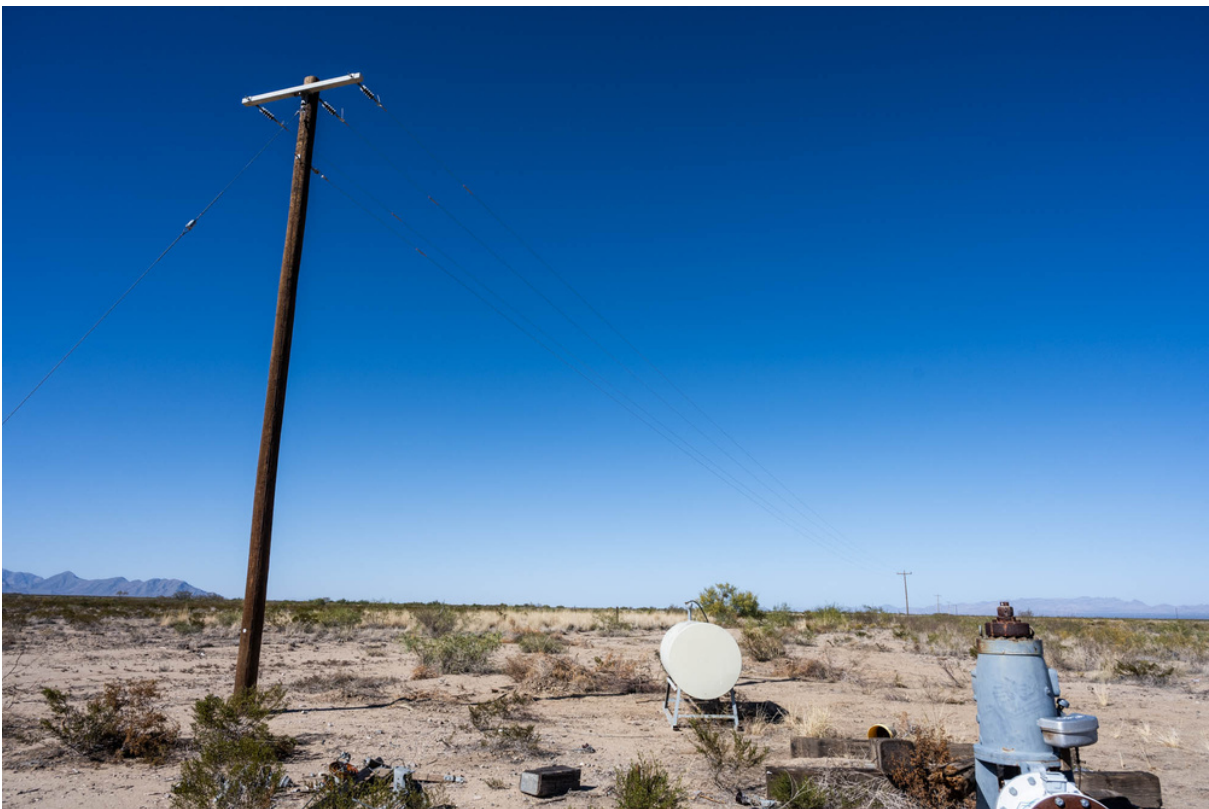
Well #2 - 800 gpm with diesel engine